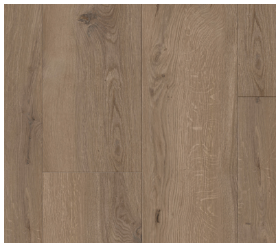
GYANT DARK BROWN 62001645