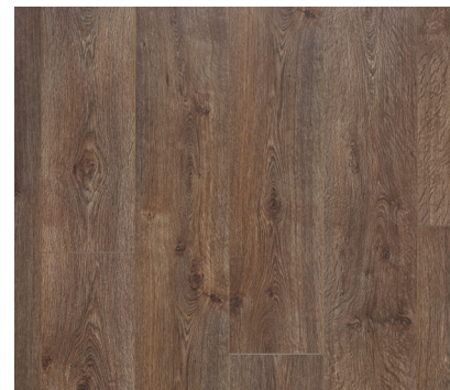
TEXAS BROWN 62001638