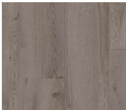
GYANT GREY 62001641