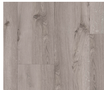
GYANT LIGHT GREY 62001639