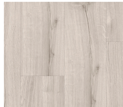
CANYON LIGHT GREY 62001642