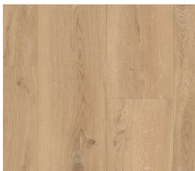
GYANT NATURAL 62001643