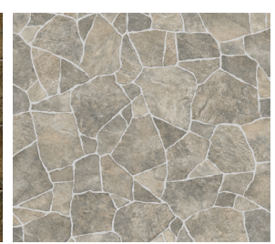
LABYRINTH STORM 50045958