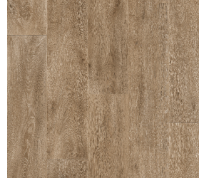
STATION OAK PEANUT 50045944