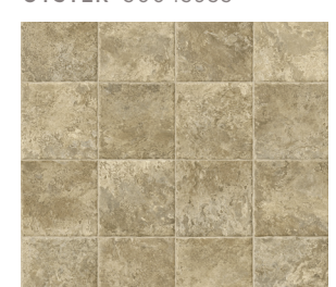
UPTOWN KHAKI 50045952