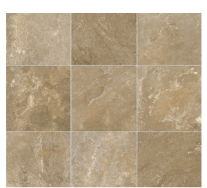
MAINSTREAM OYSTER 50045955