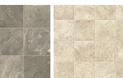
UPTOWN WHEAT 50045953