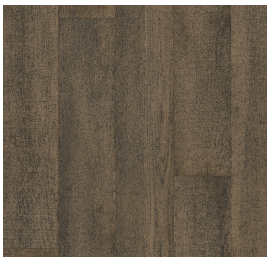
BARNWOOD CROSSING COFFEE 50045946