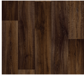
URBAN OAK BRUNETTE 50045949