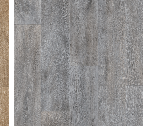
STATION OAK FOSSIL 50045943