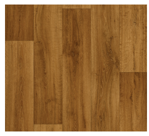
URBAN OAK GINGER 50045950