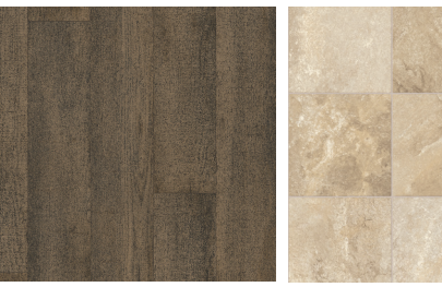
MAINSTREAM PEARL 50045956