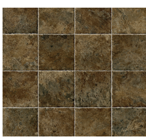
UPTOWN CHOCOLATE 50045951