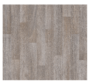
CAPITOL OAK MINK 50045945