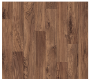
MIDLAND HICKORY SPICE 50045947